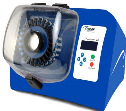
PowerLyzer ® 24 Bench Top Bead-Based Homogenizer Catalog#13155 ( www.mobio.com/powerlyzer )