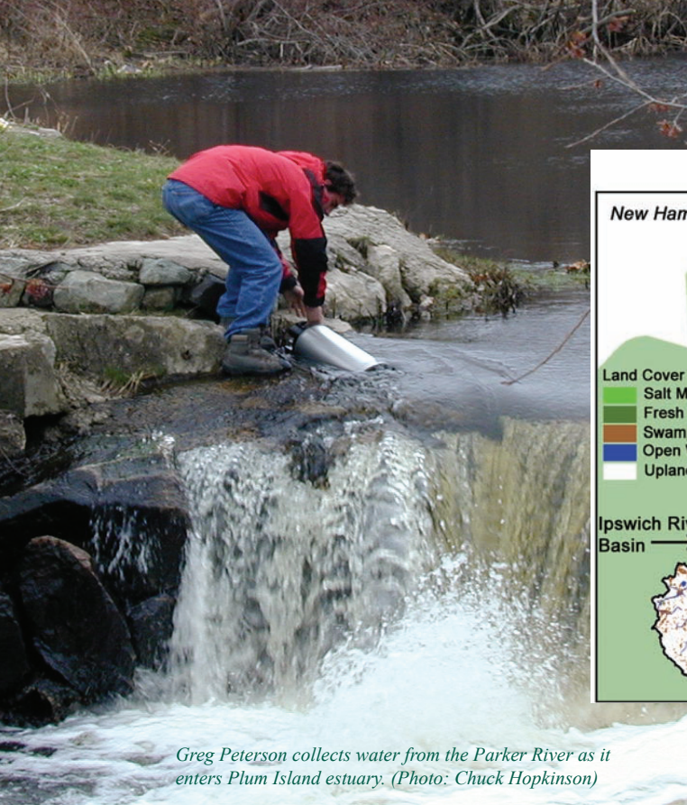
Greg Peterson collects water from the Parker River as it enters Plum Island estuary.