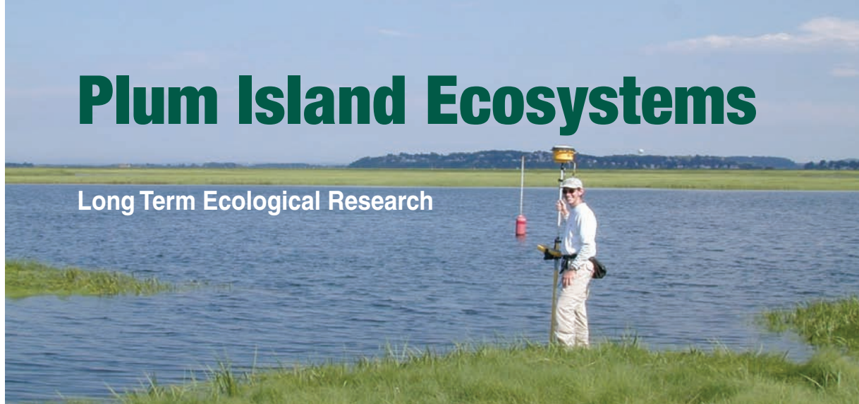
Josh Goldstein conducts a high-precision kinematic survey of marsh elevation.

E stuaries are among the most productive ecosystems on Earth. Their location at the land-sea interface, where growth-stimulating inputs from river runoff mix with ocean tides, contributes to a broad diversity of primary producers and some of the most productive fisheries in the world. But estuaries are also increasingly threatened by a variety of natural phenomena (climate variability, sea level rise) and human actions (nitrogen pollution, freshwater withdrawal, sediment erosion, overfishing).