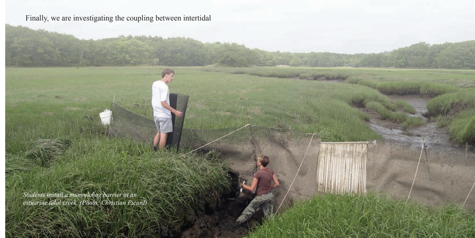
Students install a mummichog barrier at an estuarine tidal creek.

Educating the next generation of citizens and scientists and providing public outreach are integral components of the PIE LTER. Plum Island estuary is an active training ground for undergraduate and graduate students as well as post-doctoral fellows. They participate in all facets of our research. In connection with the Mass Audubon's Salt Marsh Science Project and the PIE LTER Schoolyard Project, we offer K-12 students and their teachers opportunities to better understand the ecology of estuaries, the value of long-term ecological research and the threats posed by human activities and global change. We also work with numerous non-governmental organizations and local, state and federal agencies to address issues related to population growth, land use change, sea level rise, climate change, water diversions, and river dams.