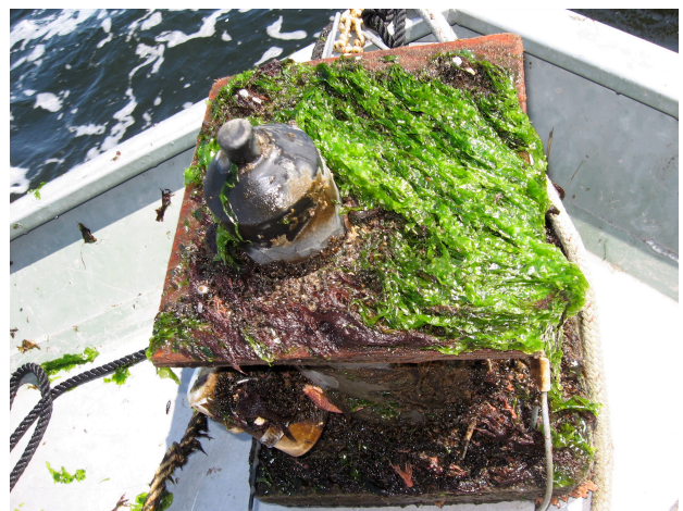
A receiver after a season of listening for fish. Every time a fish passes the receiver, its individual id, the date and the time are recorded.

Plum Island is a dynamic ecosystem and a place many people call home. We hope our study will help to predict the response of striped bass to man made and natural changes such as water temperature, availability of prey, water quality and fishing. The more we know about how striped bass react to their world, the more we can predict how they will behave in ours.